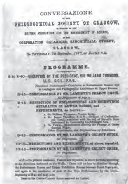
The programme from the Society's 1876 Conversazione.

Over 2,100 persons enrolled for the meeting. There were eight different scientific sections and in total 349 papers were presented. The British Association met again in the city in 1876 when Sir William Thomson (later Lord Kelvin) was president, and the Society held a Conversazione and Exhibition in the McLellan Galleries in honour of the occasion. When the planning of this was being discussed by the Society, it was suggested that as part of the social programme