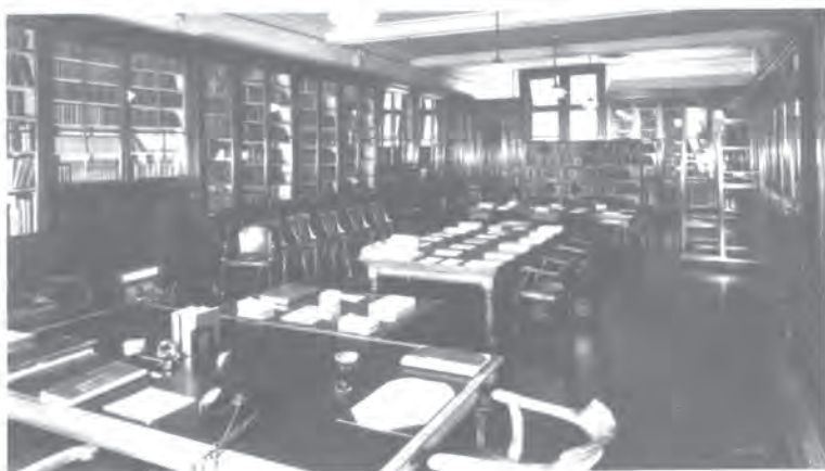
The new library and reading room.

In 1879, the Society was incorporated under the Companies Acts of 1862, 1867 and 1877 as a company limited by guarantee (up to 5/- per member), and named The Philosophical Society of Glasgow. There was a new constitution, though the new articles generally repeated the regulations of the old Society. Honorary and corresponding members (see page 43 and Appendix 2) were continued and a new drive was made to encourage members to compound their annual subscription into a life membership. There was an increase of 100 members in that year, 25 of which were life memberships.