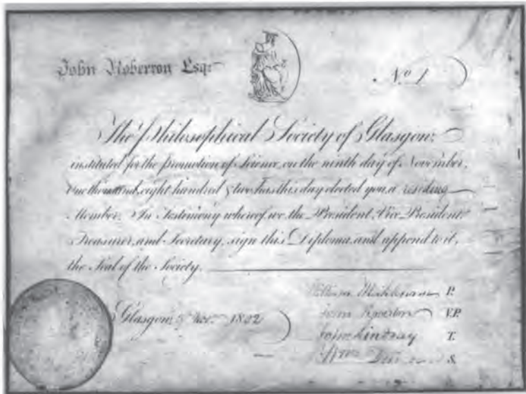
The Society's first membership certificate.

From the beginning it was intended that meetings would be held weekly in the winter and fortnightly in the summer and that members would present papers and exhibit models, artefacts, etc. However, attendances soon dropped off as many members had not prepared anything and on such occasions there was only general discussion. In fact, throughout the early years of the Society, membership fluctuated widely. (Membership at ten-yearly intervals is shown in the table in Appendix 4). There continued to be a steady trickle of new members but others dropped out, or did not renew their subscriptions. In 1806, only 36 members had paid their annual fee, while in 1810, 114 paid up members were listed. By 1820, the loss of members was a worry and it was decided to reduce the entrance fee to one guinea. This had little effect and by the 30th anniversary in 1832, membership had fallen to 47 which included six of the original members. However, the variety of occupations of these 47 members does shows how wide